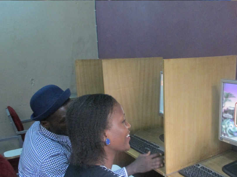
Some of The Educator's senior peer mentors