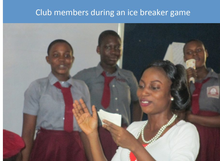
Club members during an ice breaker game