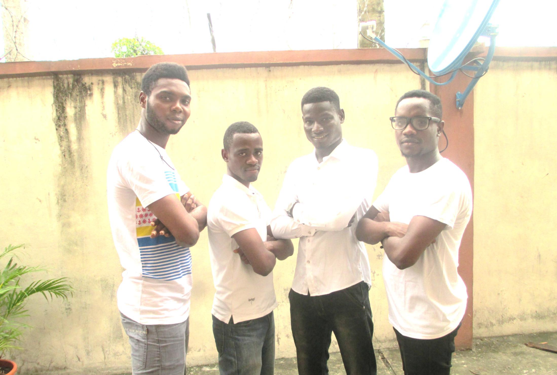
Some of The Educator's Senior peer mentors