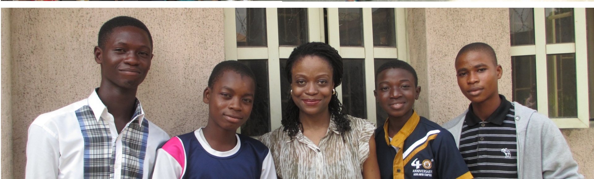
The Educator's team taking group pictures with peer mentors after the intensive one week training.