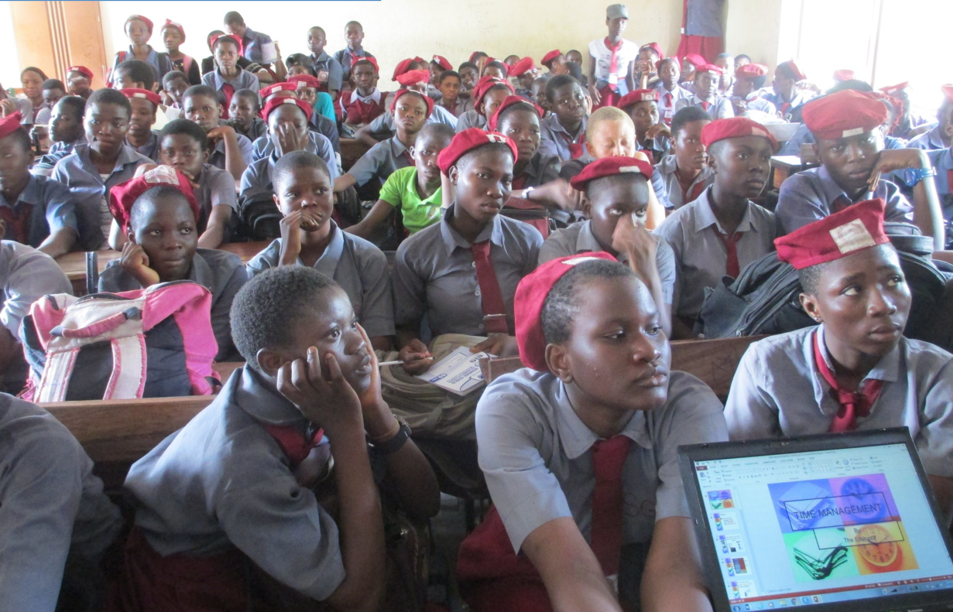
The Educator's club members during Time Management class with Surulere Girls Senior Sec. Sch