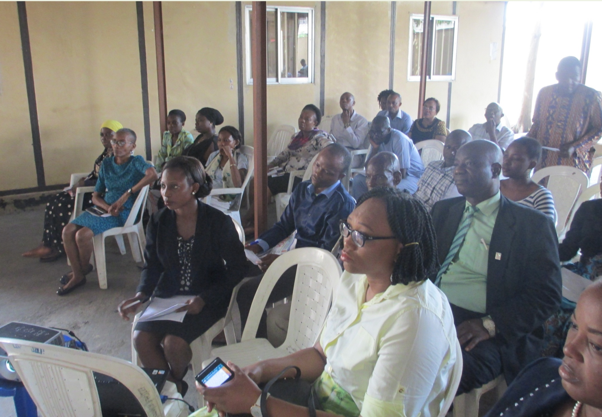
The Educator's team during training at the Educational District IV Sabo