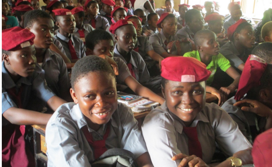
Club members during The Educator's school club meeting